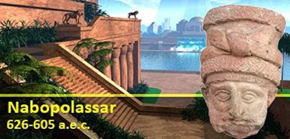
Nabopolassar 626-605 a.e.c.